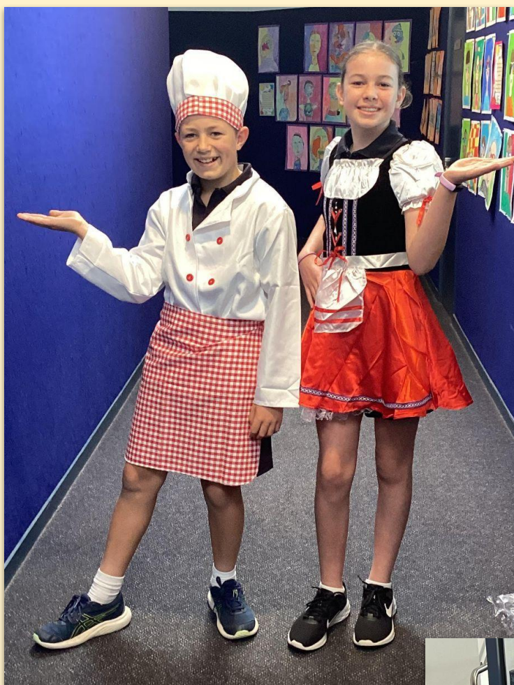
Ratatouille by 5L