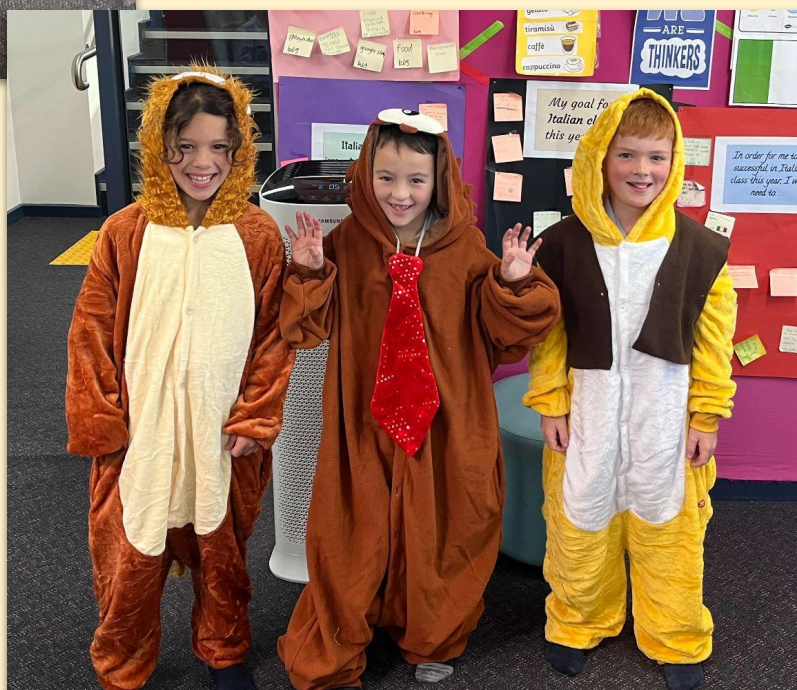
Hakuna Matata by 3M